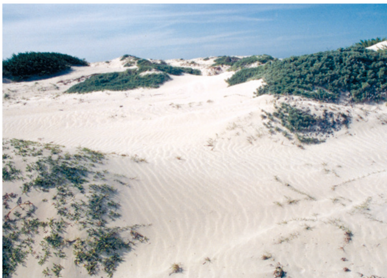
Endangered dunes in Aruba

Fortunately, the National Geographic article states that there may still be hope for the low scoring destinations, but it will take decision-makers to take tough decisions, and the community at large to assume responsibilities and find a balance to ensure that the natural heritage is conserved and protected for the enjoyment and benefit of both current and future generations of the island's inhabitants and visitors alike.