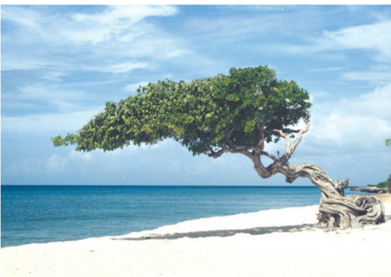
Landmark tree victim of vandals